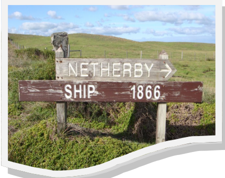
Netherby Cove, King Island.

2nd Edition now available. Orders via www.burgewoodbooks.com.au