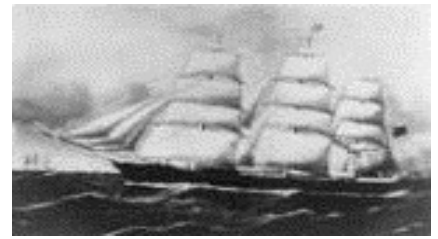
Not the Netherby but very similar. No known photos of the Netherby exist!