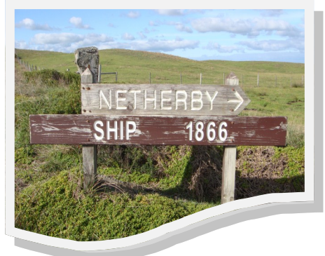
Netherby Cove, King Island.

2nd Edition now available. Orders via www.burgewoodbooks.com.au