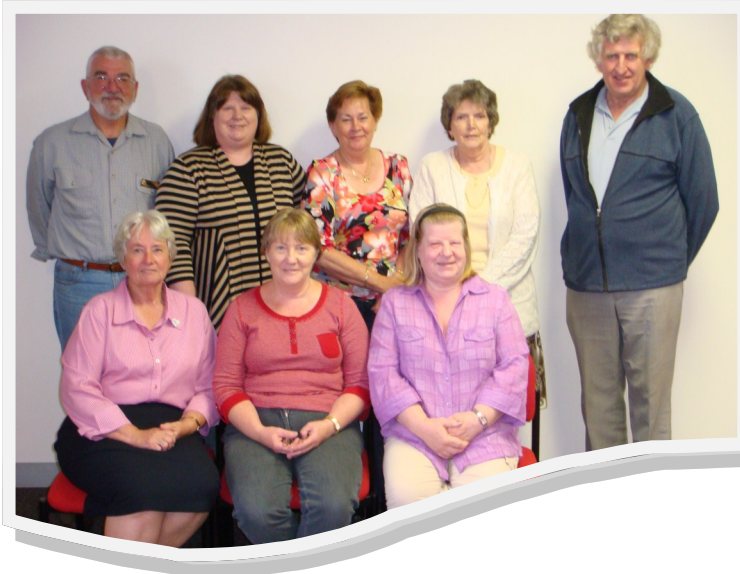
Descendants of Cubbin family Morris family Cox family Schrader family and Turner family attended a meeting at the end of February 2011.